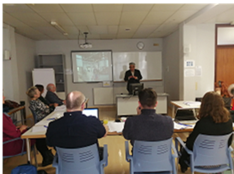
European Ceramic Work Centre