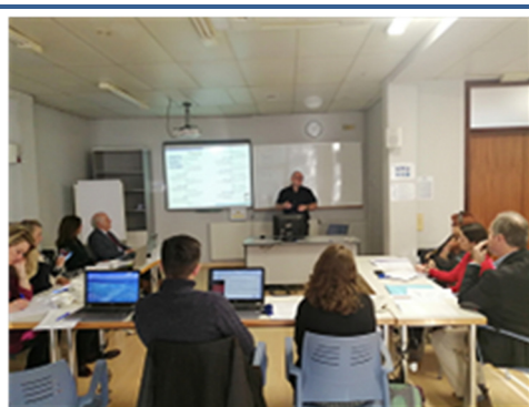
Exponential Training Assessment