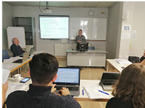
Momentum Educate and Innovate