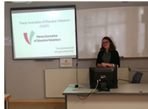
Vienna Association of Education Volunteers