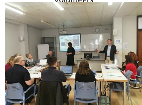
Fundación CESTE educación y empresa

The dates for the next partnership meeting have been agreed for April 2 and 3, 2020 in Vienna. We will use this meeting to present the results of our first task: to develop the Training Manual on the use of digital tools to help business grow.