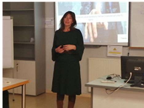
Soluciones Tecno-Profesionales Consulting